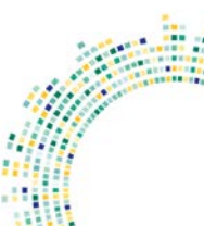
Figure 1: The combination of components making Eklipse unique