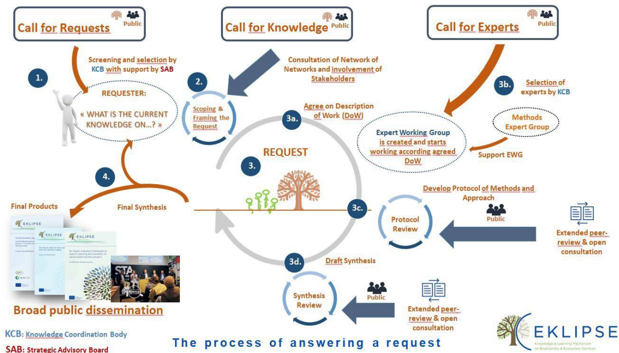
Figure 2: The EKLIPSE process of answering a request